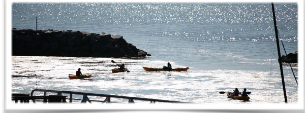
Kayaking in the breakwater